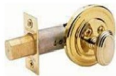
Dead Bolt / Thumb Turn